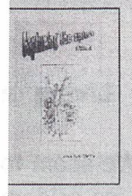
Capturing the Spirit of Francis & Clare

providing a book: Capturing the spirit of Francis & Clare , as well as a Leader's guide for this program. We hope to have both books published by mid-September, 2006.