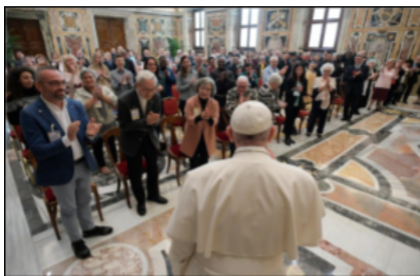
Pope Francis receives a warm applause by Secular Franciscans in the Vatican on November 15, 2021

Your vocation is born of the universal call to holiness. The Catechism of the Catholic Church reminds us that "lay