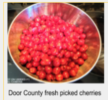
Door County fresh picked cherries

1 Tablespoon cold unsalted butter, cut into small cubes